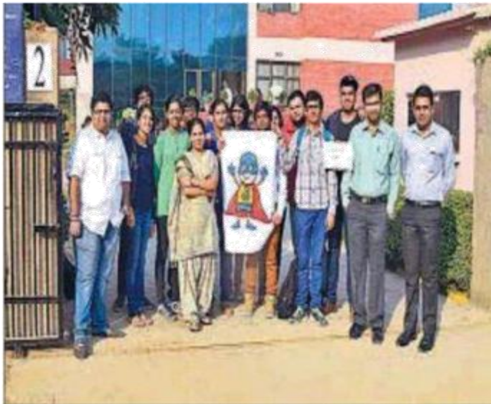
• An interactive session by students of IP University was held at CRPF Public School, Dwarka.

इसका उद्देश्य कानूनी सहायता को सुलभ बनाना है। इसका उद्देश्य कानूनी सहायता को सुलभ बनाना है। इसका उद्देश्य कानूनी सहायता को सुलभ बनाना है। इसका उद्देश्य कानूनी सहायता को सुलभ बनाना है।